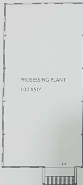
GROUND FLOOR PLAN (SCALE 1:100)